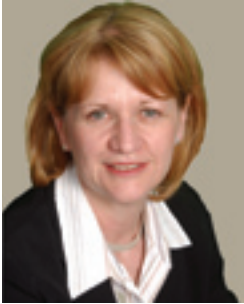
Beverly Hughes Minister of State Department for Children, Schools and Families

This guidance is just the starting point for generating ideas to improve transport arrangements locally to increase participation in positive activities through better coordination and planning at local level. This is a real opportunity for you to make a difference to the lives of the young people and your local communities.