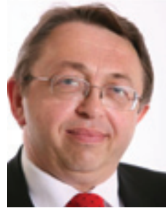
Paul Clarke Parliamentary Under Secretary of State for Transport