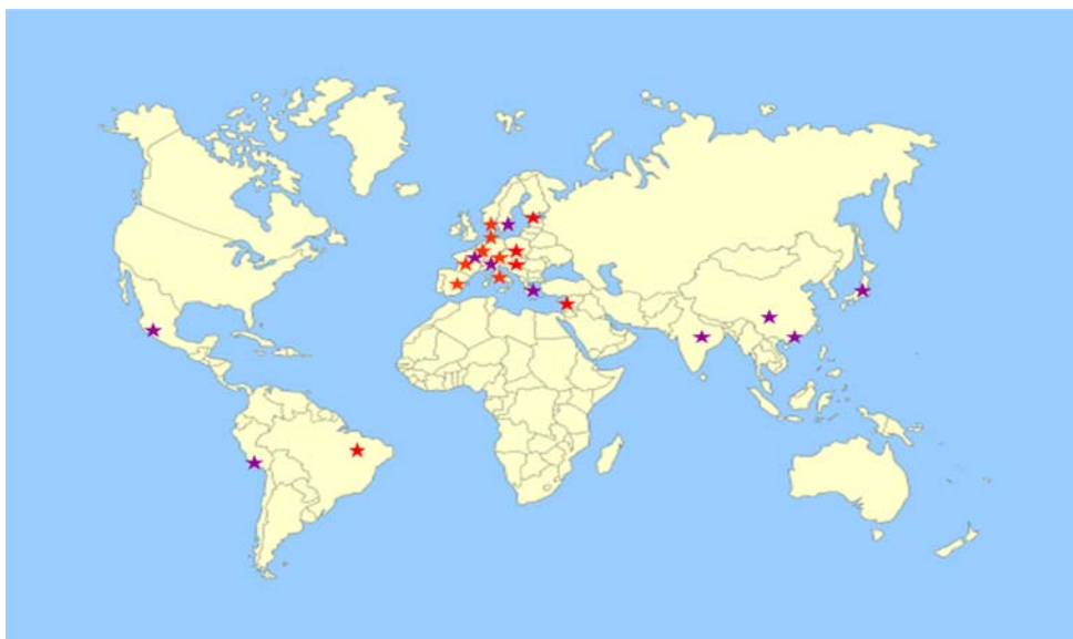
Figure A1. Countries scoped for Phase 1 report*

*Initial information was gathered about countries highlighted with a purple star, but only those highlighted with a red star were included in the initial scoping report.