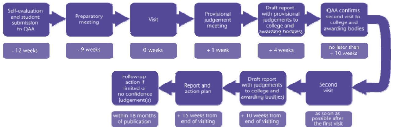
Figure 2: Key stages of a Summative review which results in a provisional and/or confirmed judgement of limited or no confidence in one or both of the core themes of academic standards and quality