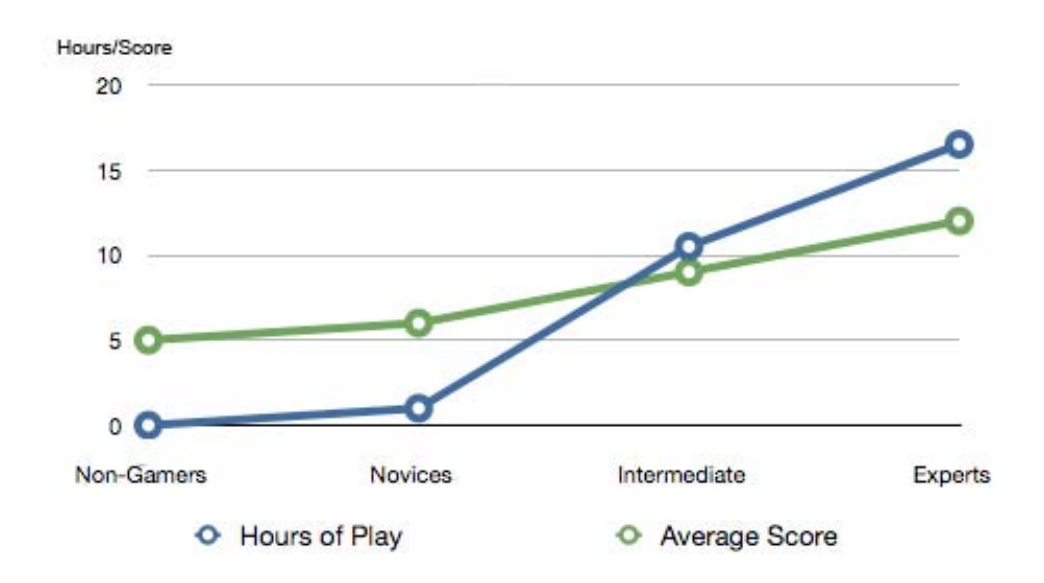
Table 1: Correlation of Game Time and Test Score

An accepted digit-span forward test of working memory ability (Lichtenberger, Kaufman and Lai, 2002) was completed by 238 of the participants, 165 male and 73 female, with an average age of 32 years. Those who played games scored an average of 40 per cent higher than those who did not. Participants who considered themselves as Novice players, averaged game time of less than one hour per week and their scores were similar to those who did not play games. Those who considered themselves as expert players averaged 16 hours game time per week and scored higher than intermediate players (see Table 1), showing a correlation between cognitive ability and hours of play.