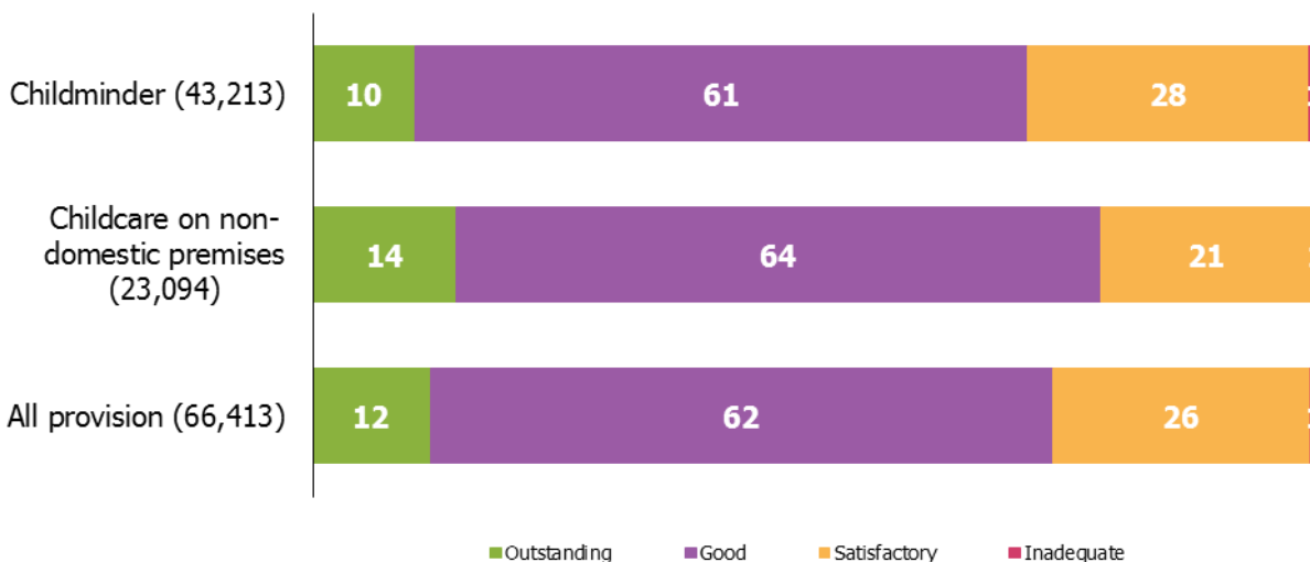
Chart 2: Overall effectiveness of active early years registered providers at their most recent inspection as at 30 June 2012, by provider type (provisional) 1 2 3