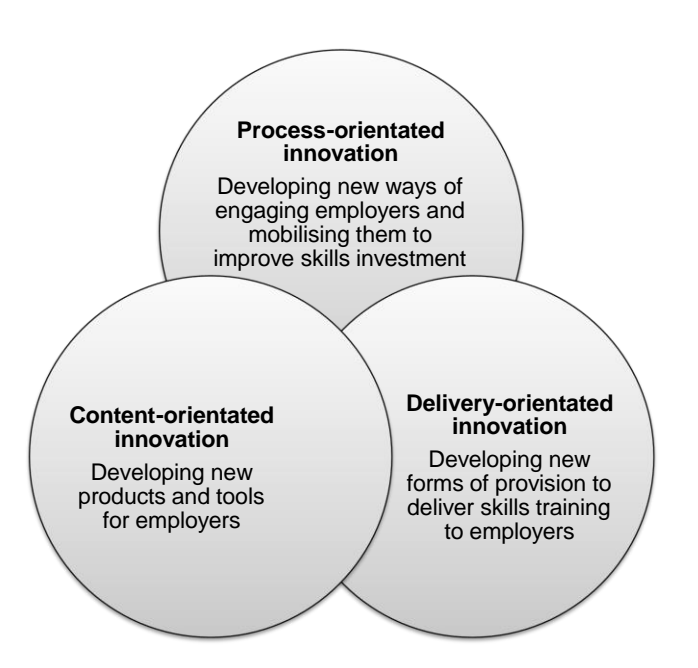
Figure 2.2 Type of innovation

The type of innovation relates to the aspect of the skills solution that is new. This can be classified in relation to 'process', 'content' or 'delivery' as set out in in Figure 2.2 below. As the figure suggests, these activities are not necessarily mutually exclusive