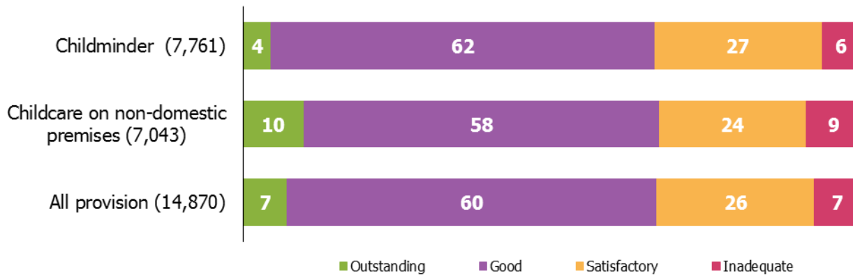
Chart 1: Overall effectiveness of early years registered providers inspected between 1 September 2012 and 31 August 2013, by provider type (provisional) 1 2 3