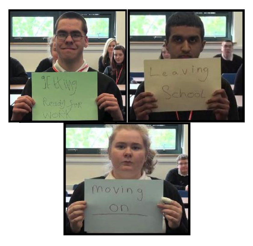
Transitions - young people from Woodlands School

Children and young people go through many transitions when changing schools, with changes that happen in school and when moving on from school. In all cases it is a critical stage, and the way it is guided and supported can have a major bearing on the rest of a young person's life chances. Building directly on prior learning, transitions are effective when they are planned well and implemented in good time. The Getting It Right For Every Child (GIRFEC) integrated-service approach, the Additional Support for Learning (Scotland) Act 2004 (amended 2009) and the forthcoming Children and Young People's Bill (2013) are central to effective transition planning.