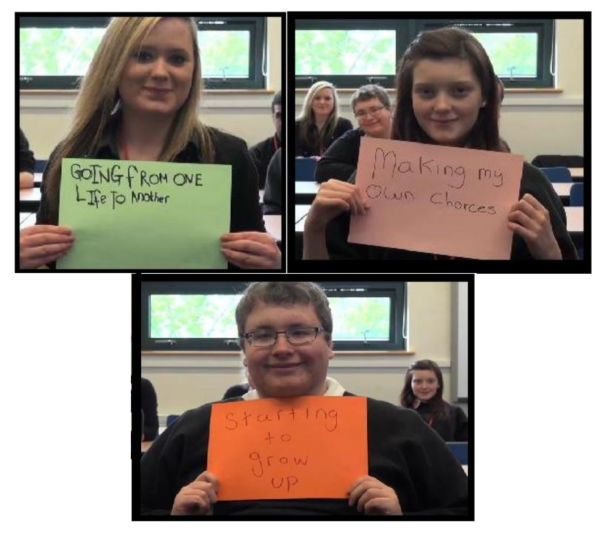
Transitions - young people from Woodlands School

Scottish Government is working with National Agencies and key stakeholders to deliver on these findings. There are good examples of effective practice in transitional planning for young people with additional support needs and it is important to build on these.