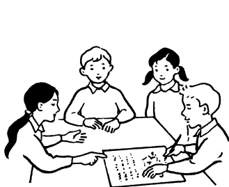
Talking and planning together

Note: If you have chosen to work on a radio or television programme, you will need to negotiate how you can show your programme – ideally you will be able to record it.