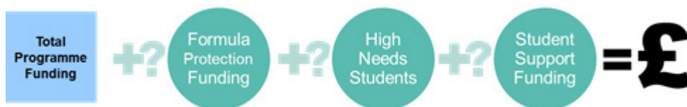
Figure 3: 16 to 19 Additional funding elements

There are also several additional funding elements that may or may not be relevant to your organisation: