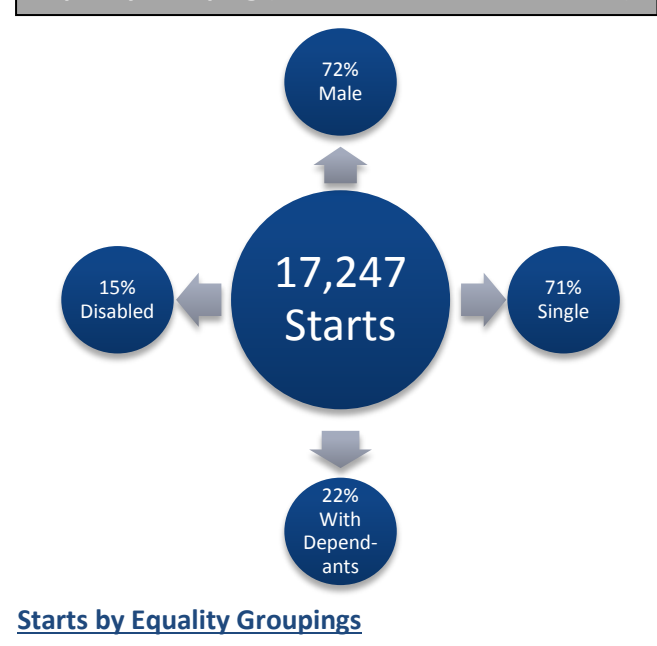
Figure 3 shows that a high proportion of clients starting S2S are male, accounting for approximately 72% of all starts (from October 2014 to March 2015) and that just over one in five (22%) clients have dependents.

Figure 3: Number of Starts on Steps 2 Success by Equality Grouping (October 2014 to March 2015)