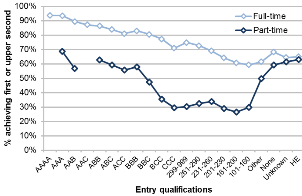
Figure C1: 2013-14 graduates achieving a first or upper second class degree by mode of study, entry qualification and degree classification