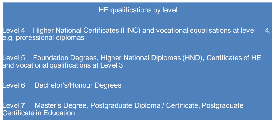
Figure 1 below sets out HE qualifications by level.

The review is focused on the delivery of higher skills qualifications at level 4 and 5 delivered by FE institutions in Wales. These qualifications are below the level of the standard Bachelor's Degree awarded by UK Universities.