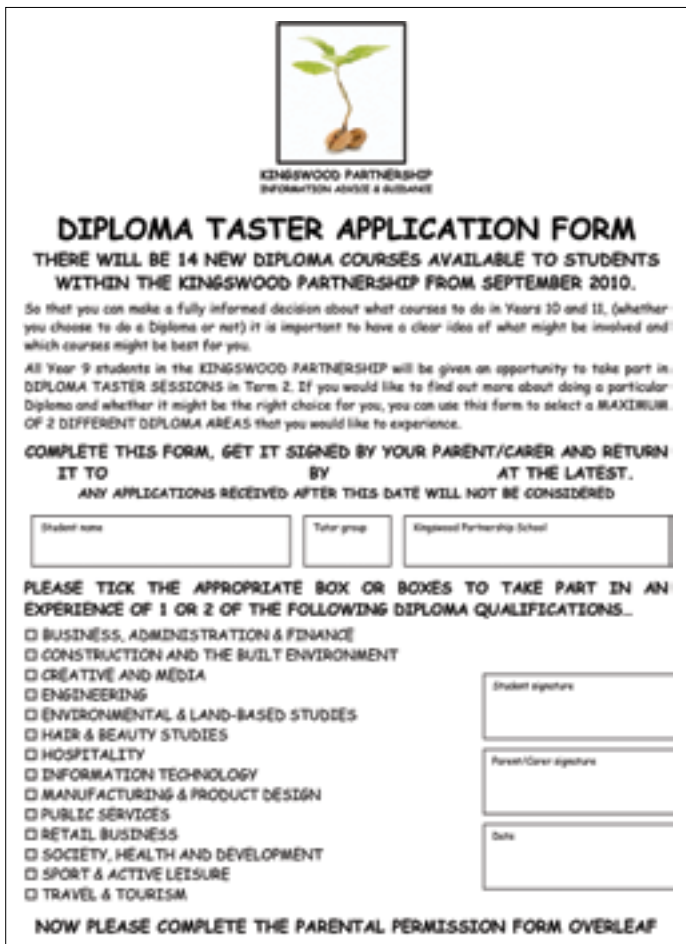
The Kingswood Partnership runs taster sessions of each of the Diplomas for their students.