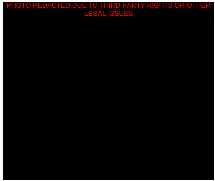
Figure 4. 4: The Rainforest Hut – replacing the usual 'home corner'