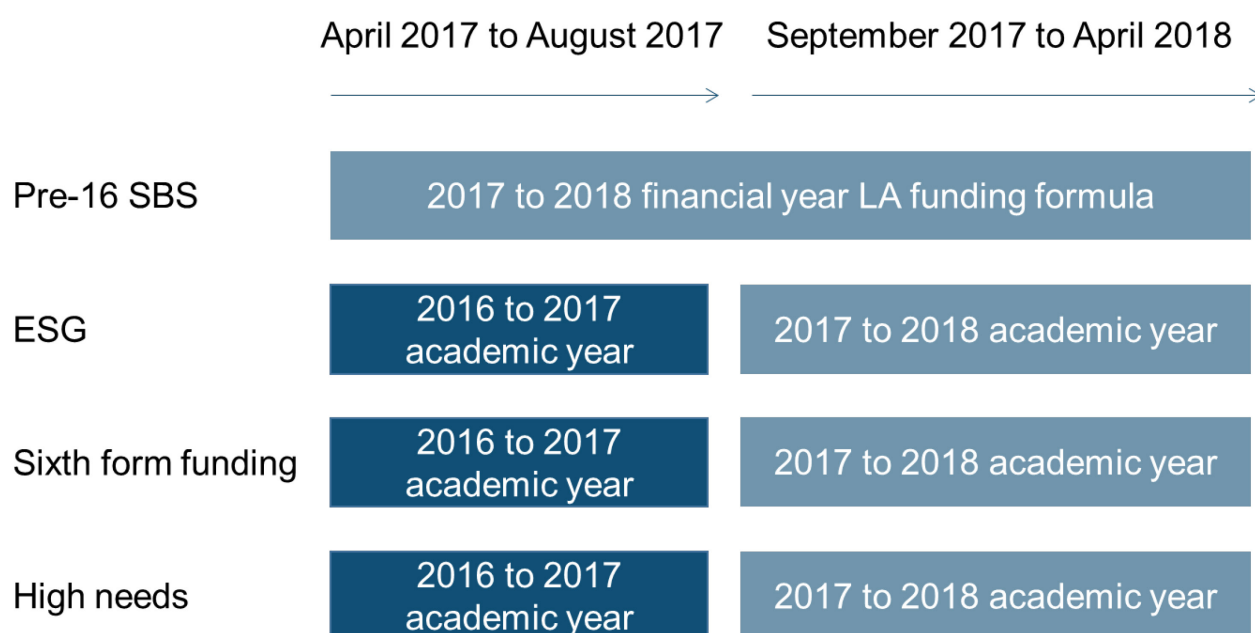
Table 9: funding factor timeline

You can find more about the ESG protection thresholds in academies revenue funding allocations .