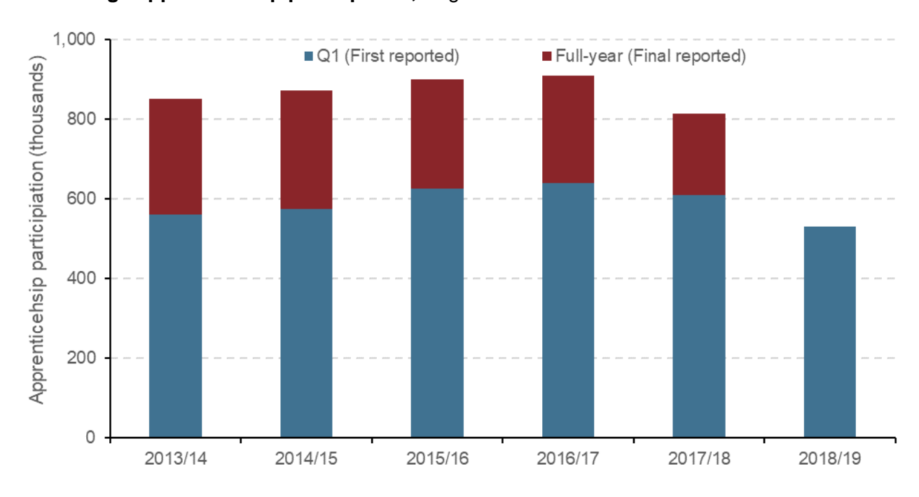
Figure 2: All age apprenticeship participation, England<sup>1,3</sup>

Participation measures the total number of apprenticeships that were active for at least one day in the academic year. A full year participation figure will be made up of all starts in that year and those continuing learning from the previous year(s). Estimates for 2018/19 will only include starts in the first quarter and learners continuing from previous years, therefore care should be taken in comparing years.