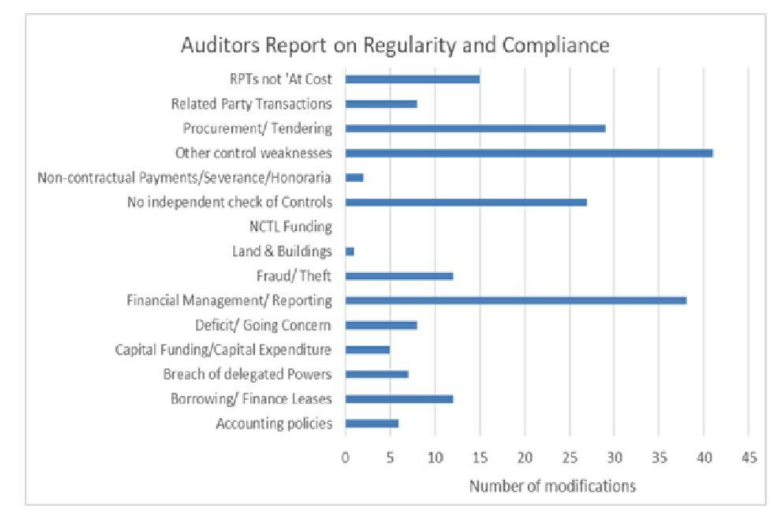
Figure 2: Breakdown of the reasons for modified regularity opinions