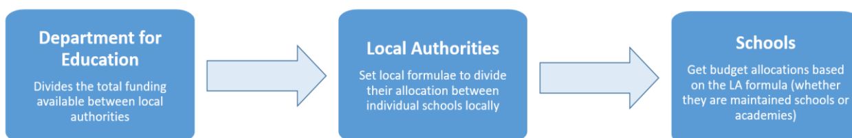
Figure 3 – Diagram of the current funding allocation system

This process applies to academies and maintained schools in the same way. The Educational and Skills Funding Agency pays academies their funding directly, based on the local schools formula for their area, whereas for maintained schools, the local authority receive the funding and then pass it on to the schools. Maintained schools are paid on a financial year basis (April to March) and academies on an academic year basis (September to August).