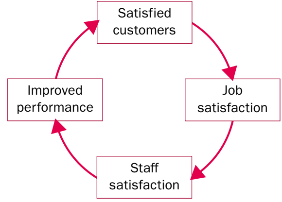
FIGURE 1 The virtuous circle of quality

Conversely, dealing continuously with dissatisfied customers will have a detrimental effect on staff morale and, hence, performance.