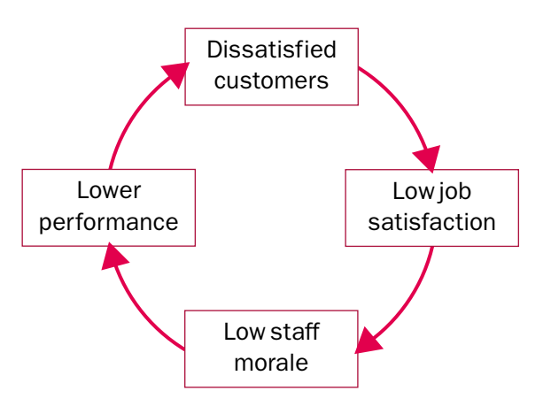
FIGURE 2 How dealing continuously with dissatisfied customers affects staff performance

Conversely, dealing continuously with dissatisfied customers will have a detrimental effect on staff morale and, hence, performance.