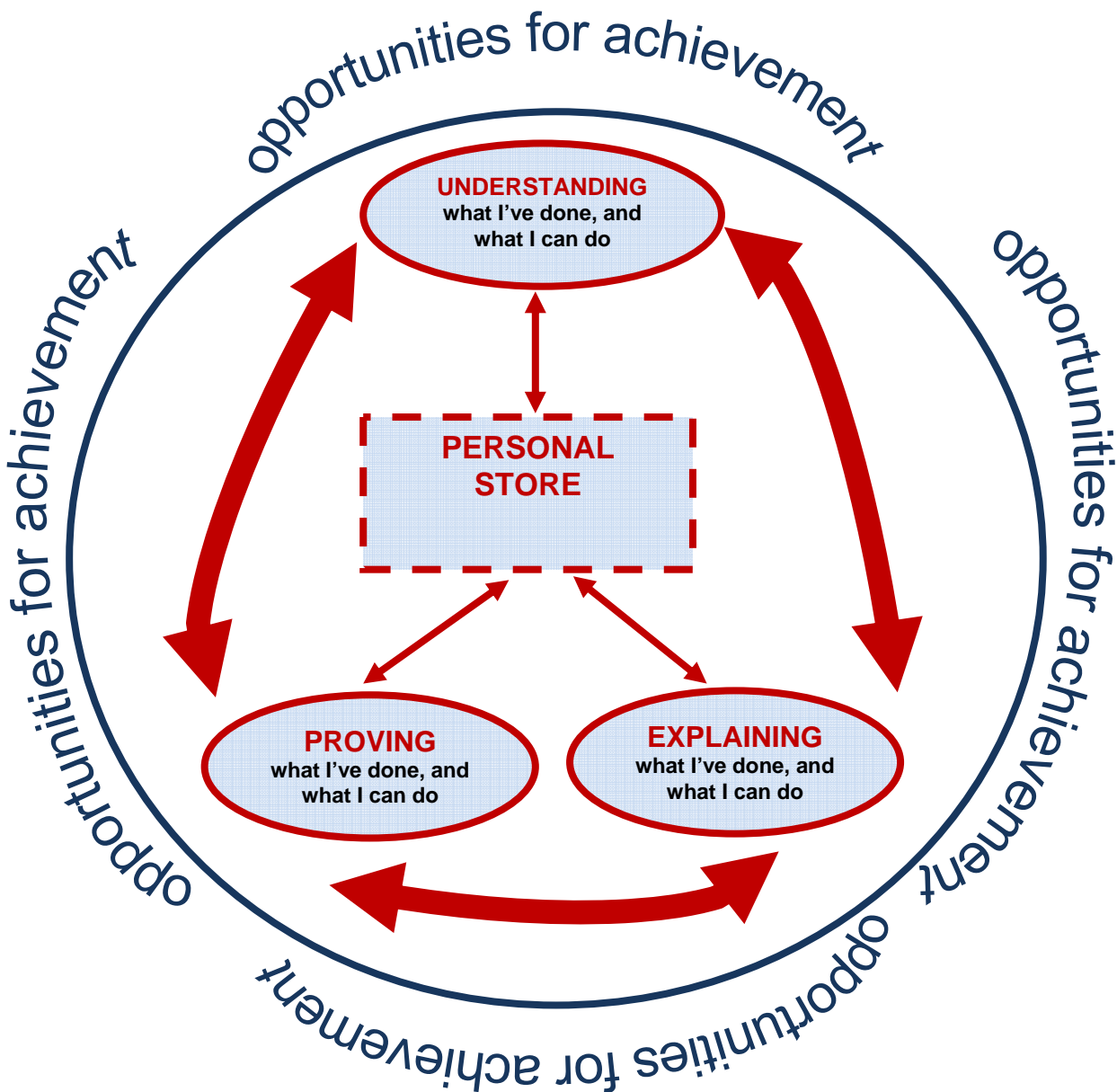
Figure 1: Model for Recognising Achievement

5.18 The model is centred on a personal portfolio or 'personal store' of materials associated with activities of all kinds and their outcomes: this can be thought of as the recording aspect of recognising achievement. The idea is that a student gathers materials associated with all kinds of achievement and learning in a personal portfolio and can use this material in different ways depending on their age and circumstances. While it appears similar in some respects to systems such as the National Record of Achievement (NRA) it is different: in particular, unlike the NRA it is not in itself the record of the achievement but rather the store from which young people selectively draw material as appropriate for a particular purpose. Equally it is different from the creation of a portfolio which is structured to match to specific criteria for an award (as is the portfolio currently being developed for the Duke of Edinburgh award) rather it is the creation of a portfolio from which evidence may be drawn to match to specific criteria for a range of possible awards if the learner decides this is appropriate and desirable.