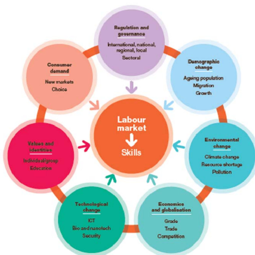
Figure 6.1 The key drivers of change