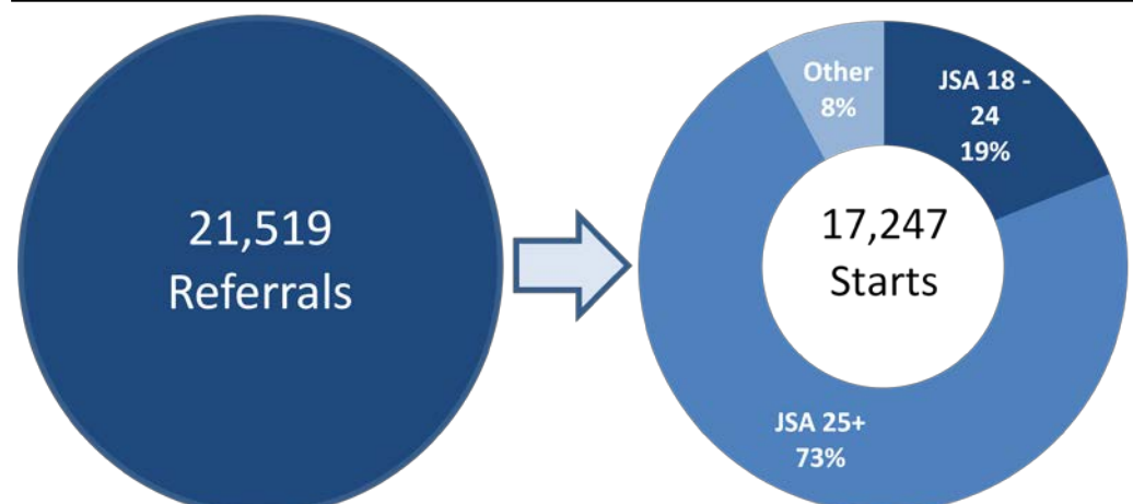
Figure 1: Number of Referrals to Steps 2 Success and Starts by Client Category (October 2014 to March 2015)

Almost three quarters (73%) of all those clients who started S2S fell into the JSA 25+ category, another 19% fell into the JSA 18-24 category and the remaining 8% of clients were from the JSA Early Entry, ESA and Voluntary categories.