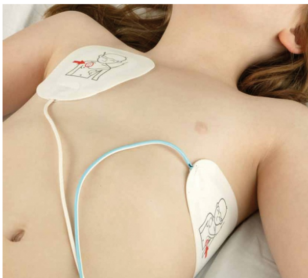
Figure 3: Paediatric AED pad placement (for use on children aged up to 8 years of age, or weighing under 25 kg) 6