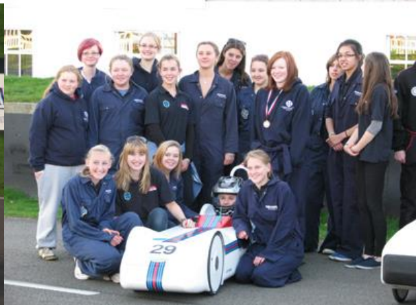
Girls in the electric car club