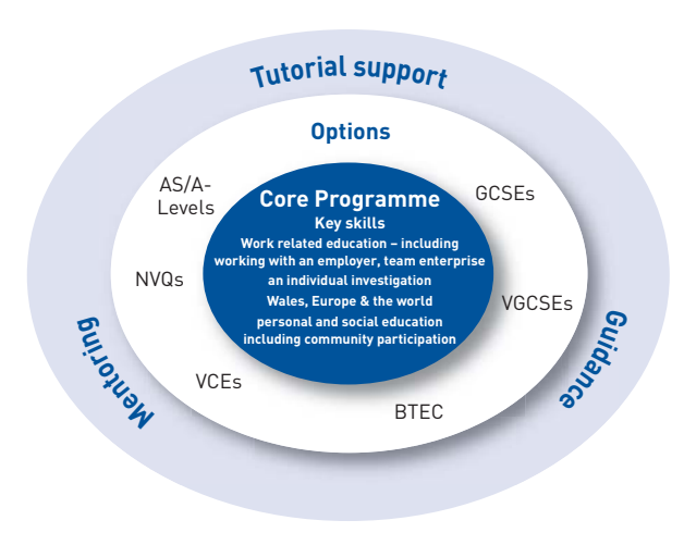
Diagram 1: The Welsh Baccalaureate