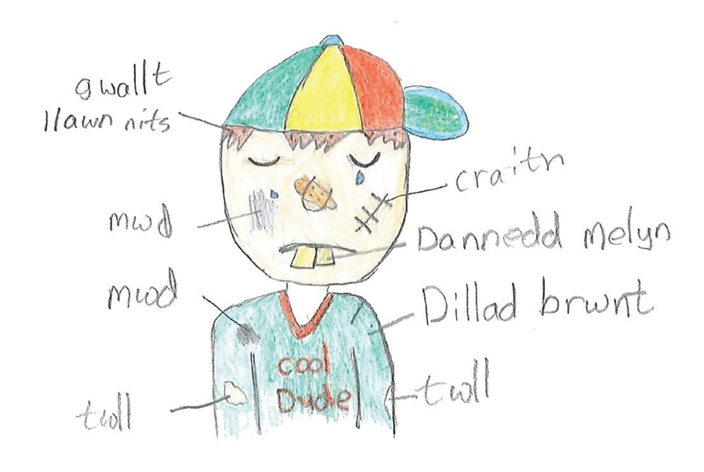
Figure 1: Image drawn by child, captured as part of Children's Commissioner for Wales consultation about children's experiences of bullying, 2016. Children were asked to draw a picture of a child who was experiencing bullying.