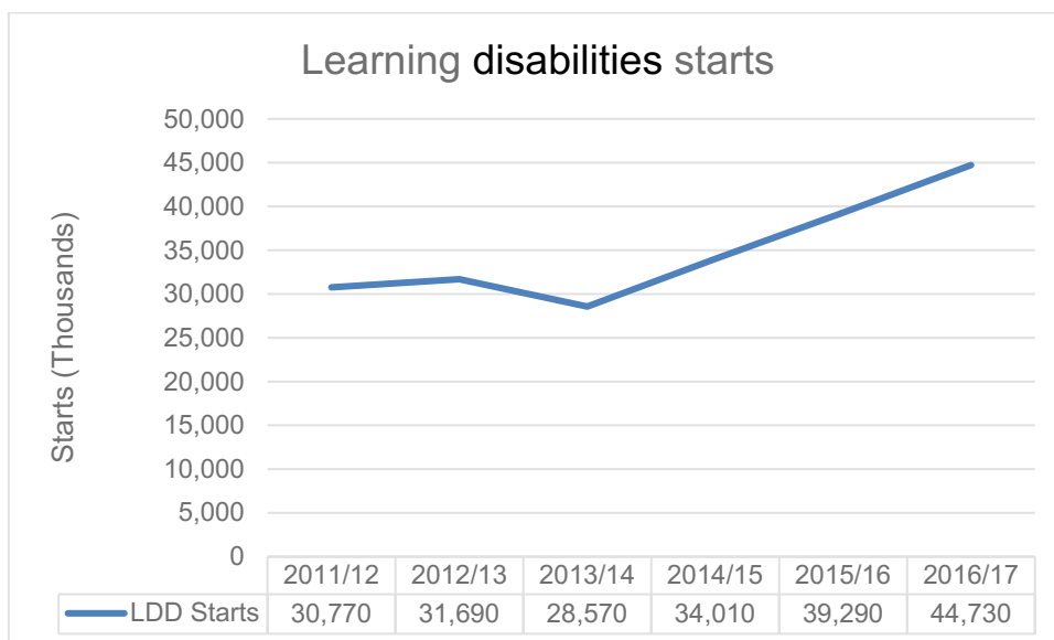
Figure 2: Learning disabilities (Q1, Q2 & Q3) from 2011 to 2012 to 2016 to 2017

This is equivalent to 10.16% during this academic year, compared to 10.22% in the previous academic year. Our success measure for this group is to increase the proportion of learning difficulties and / or disabilities participation by 20%, to reach 11.9% by 2020.