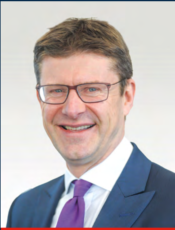
Rt Hon Greg Clark MP Secretary of State for Business, Energy and Industrial Strategy

As the Prime Minister made clear on the steps of Downing Street in the summer of 2016, this government believes in a country that works for everyone.