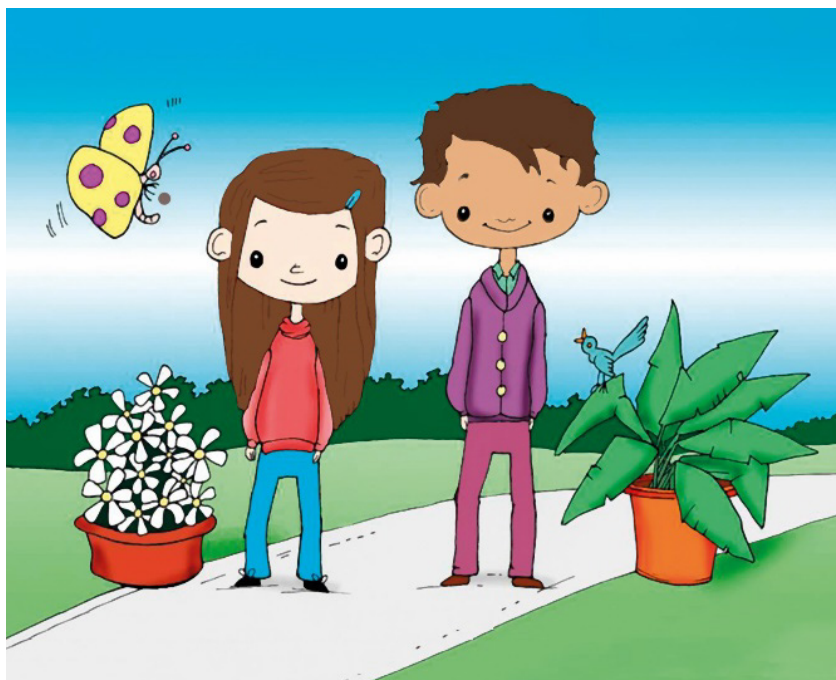
Figure 2: Example of illustrations used in the tablet-based child assessments

Mia and Tom’s names and appearance can be customised to reflect the cultural diversity within each participating country.