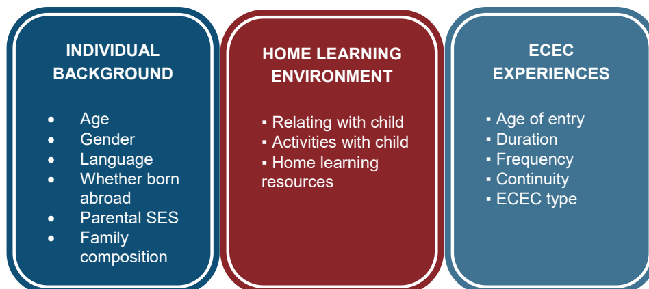
Figure 4: Topics to be assessed indirectly via parent questionnaires

The questionnaires also collect important background information about the child, their family circumstances and their teacher's characteristics. This is to enable further analysis of the different factors associated with children's skills and abilities at age five.