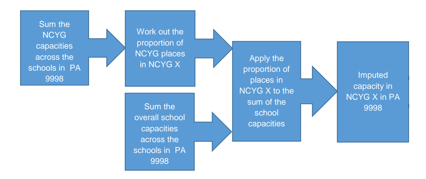
Figure 1: Diagram showing the steps involved in calculating the primary capacity in a year group using PA 9998 as an example.

The same calculation is repeated for each NCYG, from reception through to Y6, and for each PA.