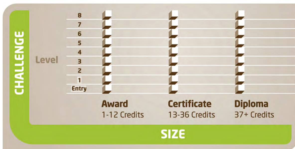
Figure 1: Level and credit in the Qualifications and Credit Framework

Full details of the QCF and the associated regulatory arrangements are provided in the Regulatory arrangements for the Qualifications and Credit Framework , available from www.rewardinglearning.org.uk/regulation/reform_of_vocational_qualifications/qcf_regulations.asp or www.ofqual.gov.uk/121.aspx .