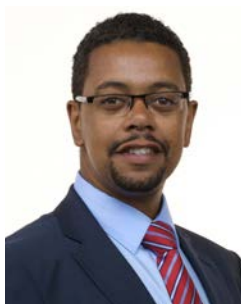
Kirsty Williams MS Minister for Education

A handwritten signature in black ink that reads "Vaughan Gething".