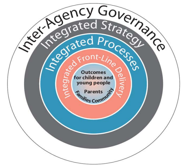
Figure 1: Model of integrated children's services

In 2003, local authorities were invited by the then Department for Education and Skills (DfES) (now Department for Children, Schools and Families) and the Department of Health to bid for funding to pilot children's trusts, and 35 pathfinders were established as a result. These pathfinders did not have to address the needs of all children in a given area, but could