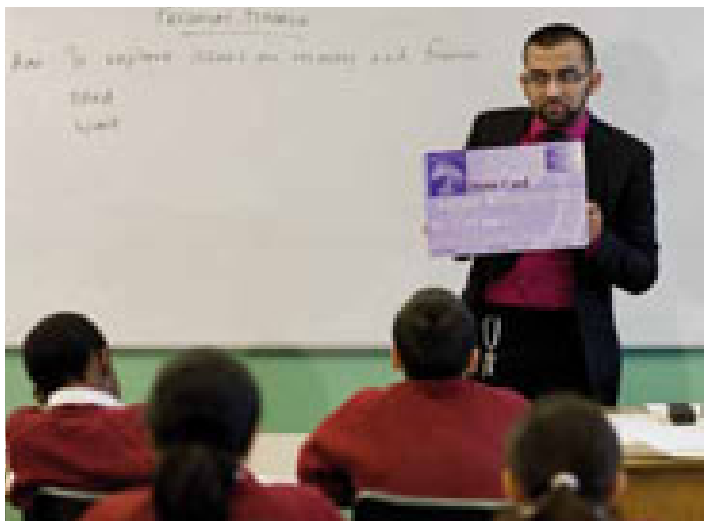
Teachers who are confident in their own knowledge of personal finance are better able to teach economic wellbeing effectively by using contexts that are relevant to pupils.