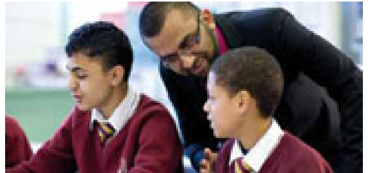
Many schools also develop their own resources in order to meet the particular needs of pupils and to reflect the culture of the school.

Make Money Make Sense (Citizens Advice Bureau)