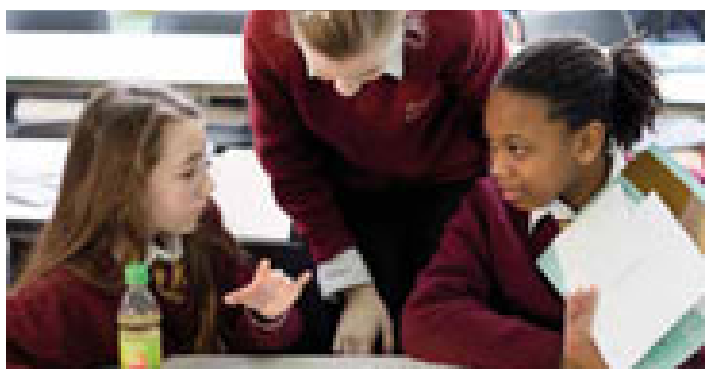
Learners can be given opportunities to identify evidence of progress in their own work and reflect on their changing skills and values in addition to their knowledge.

Assessment should be formative in nature, helping to shape future plans and adapt teaching approaches to meet the needs of pupils. It should also be a vehicle for celebrating successes and strengths: good quality feedback to students is therefore an important part of the process.