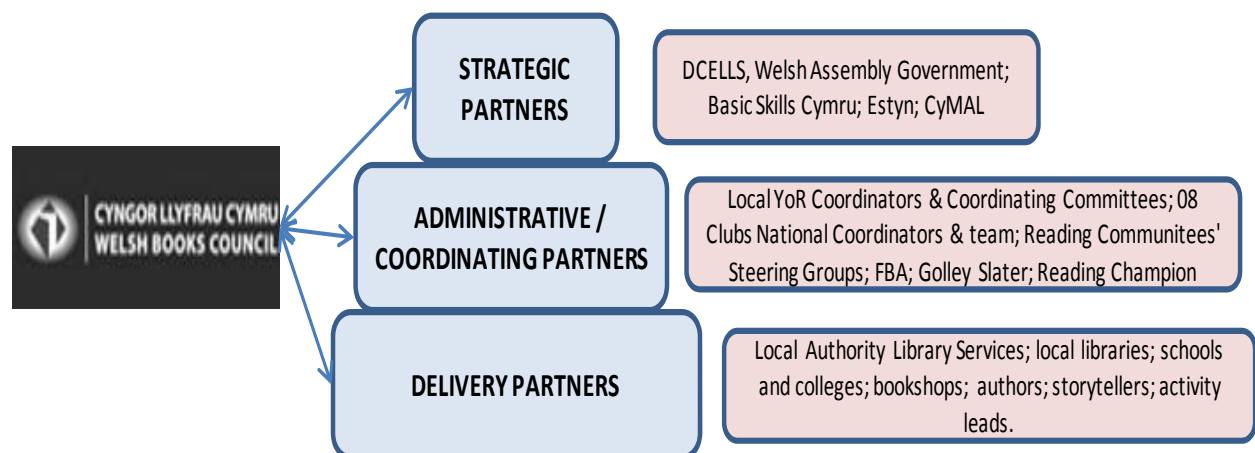
Figure 2: Welsh Books Council's partners in the management and administration of the National Year of Reading in Wales

The third and final tier of partners comprises those who delivered the wide range of activities that took place during the National Year of Reading in Wales. At the launch of the Year of Reading in March 2008 the Education Minister, Jane Hutt AM, set the ambitious challenge to the people of Wales to arrange and participate in 2008 reading activities during the year. This was achieved, largely due to the involvement of an enormous number of organisations.