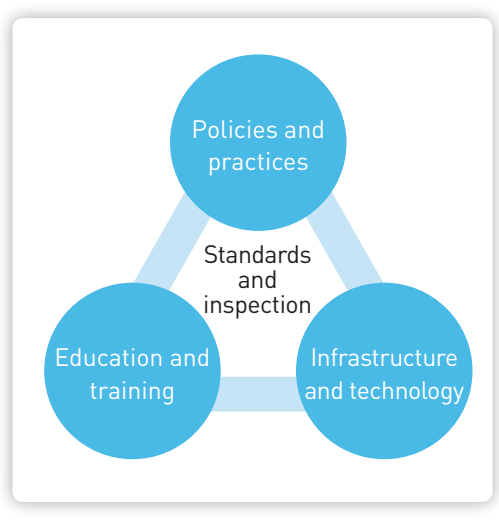
FIGURE 1: BECTA PIES MODEL

Becta's PIES model is an effective framework for approaching safeguarding strategy across learning provision. It offers a simple way of mitigating against risks through a combination of effective policies and practice, a robust and secure technology infrastructure, and education and training for learners and employees alike, underpinned by standards and inspection.