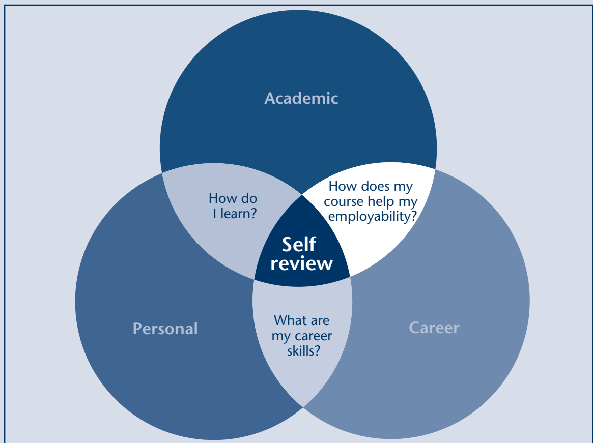
Figure 5: Effective Learning Framework model (QAA, 2005)

In practical exercises, time is used to develop skills in contemporary digital technologies and a range of literacy skills. Students are introduced to the managed learning environment, ePortfolios, blogs and wikis, in addition to the use of more traditional tools such as Word, Excel and PowerPoint. FLQs are used to direct the learning experience towards the key assessment tasks. Diagnostic tools are used to determine the need for personalised support, which is provided by academic staff and a small team of second year student tutors. Extensive use is also made of web-based materials and support tools.