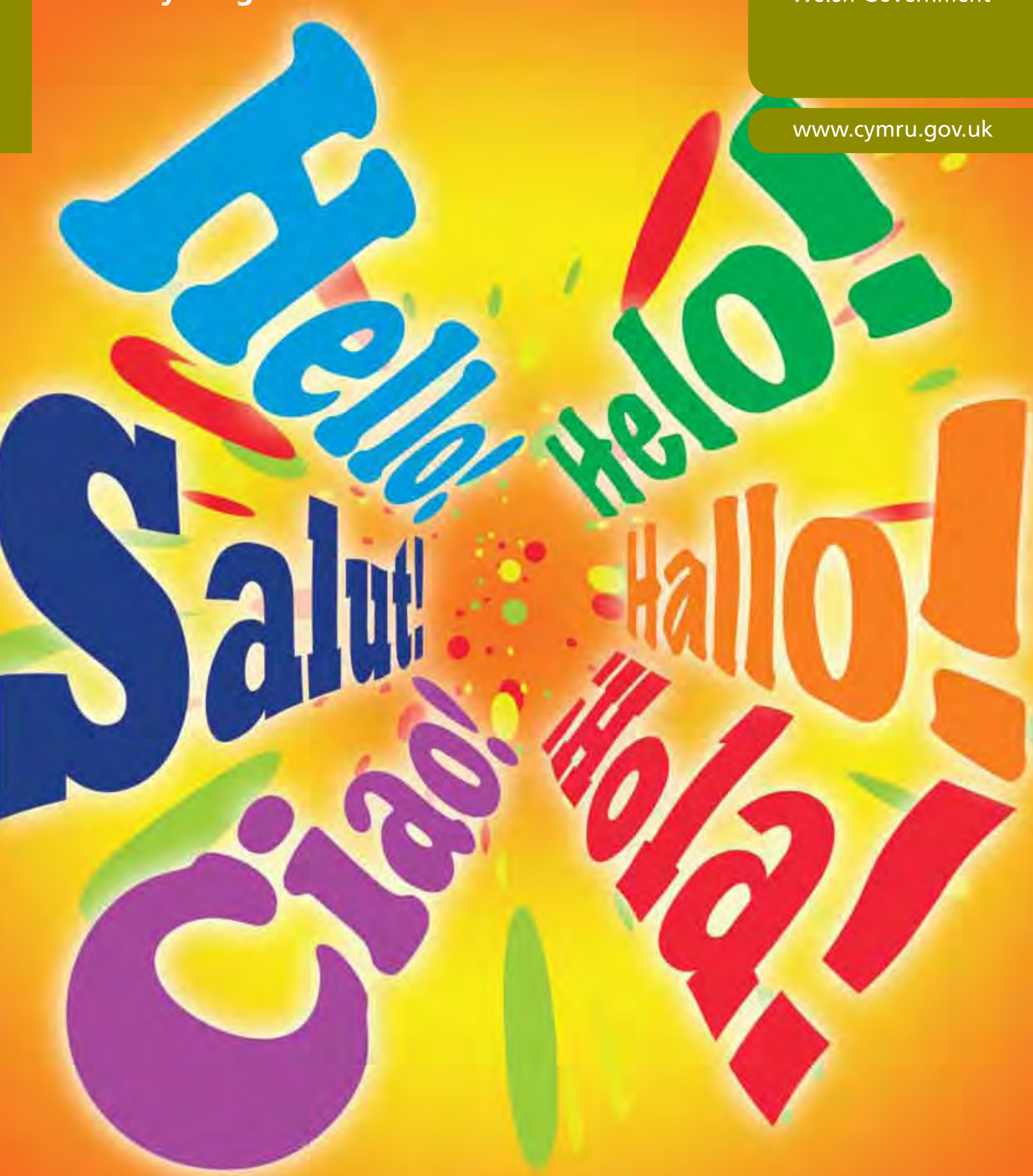
English • Welsh • Welsh second language • Modern foreign languages