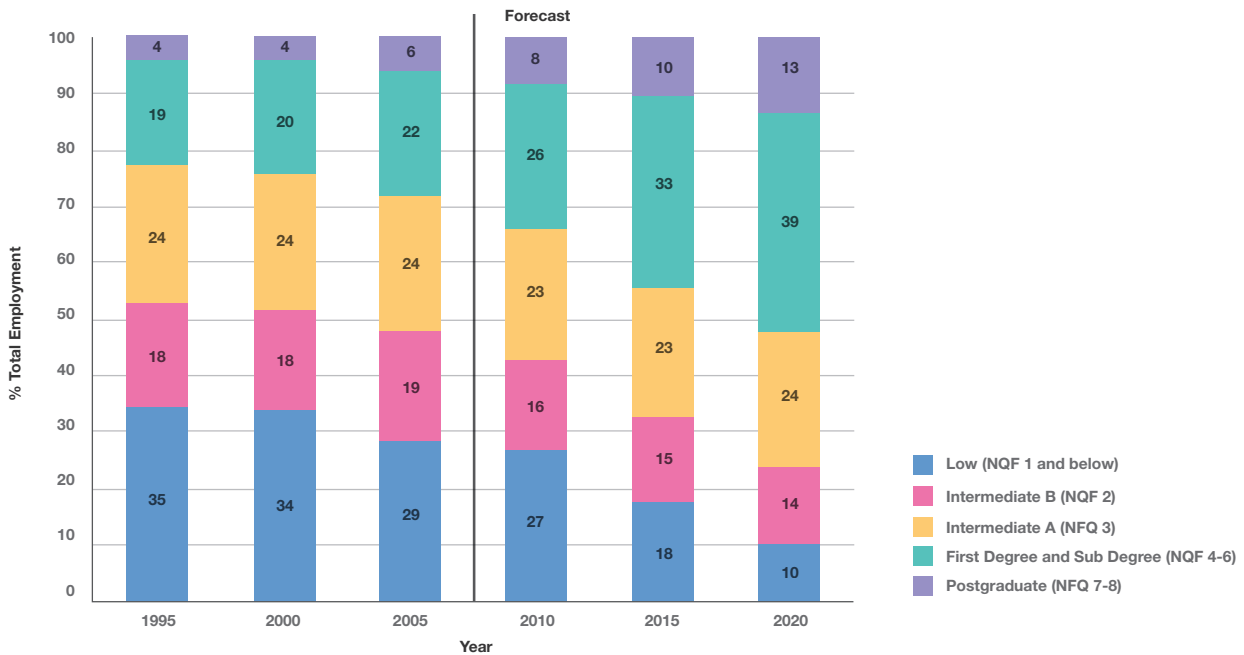
Figure 1: Qualifications of persons in employment – aspirational scenario

Higher skills, utilised effectively, can also contribute to increased productivity. Figure 2 shows the relationship between private sector graduates in employment and productivity across UK regions.