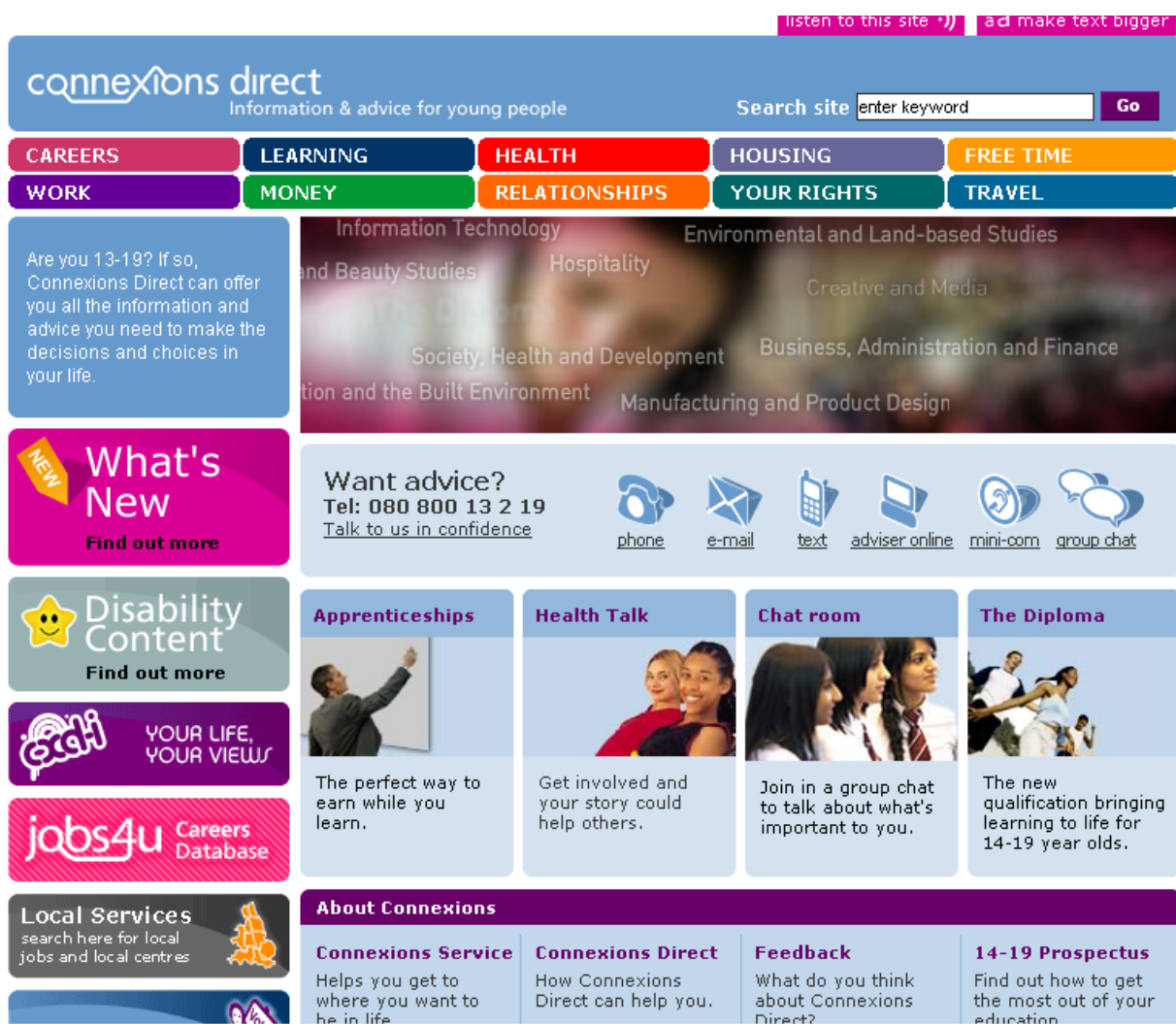
Figure 1: Screen shot of the Connexions Direct home page, showing facilities accessible by young people

A clear strength of this website is the range of opportunities provided for young people to engage with communication aspects, as well as information aspects, of technology. By contrast, a range of LA websites (14-19 Prospectuses) focus much more on information aspects, and much less on communication aspects (see Passey, Williams and Rogers, 2008).