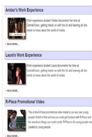
Figure 5: Screen shot of the R-Place Channel page giving access to young people's videos

Films can be about any topic. For example, 'Supermarket Smoke' – a fresh examination of the drugs issue, 'Ghost Story' – a fictional tale of love and betrayal, and 'Bottle Battles' – a spoof sports event. The films are about topics or themes the young people are interested in rather than films about themselves. Some personal profiles have been done on film (see Figure 5), with those young people who are comfortable working with the film team in that way. It is felt that more personal profiles should be done.