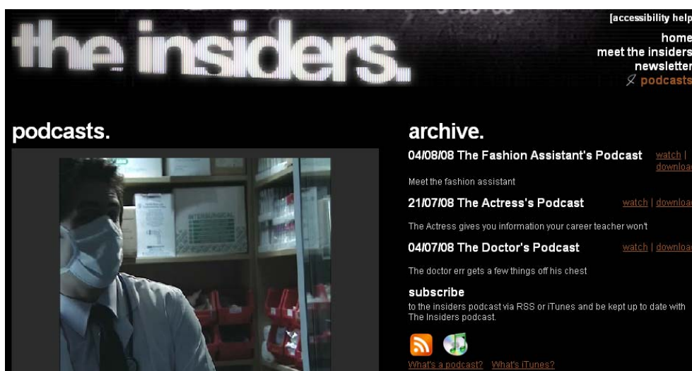
Figure 2: Screen shot of the web page showing the doctor’s podcast being played

A key issue with websites that provide details about opportunities is that they rarely provide young people with any insight about what certain jobs or opportunities involve, what they might be doing when they apply for a job or join a course, or what others have felt about their experiences. A new education development from Channel 4 (2008), called ‘The insiders’, offers some examples of insider insights from young people who have been involved in certain jobs or opportunities. This career information project uses short comedy clips developed from real-life work blogs of individuals working in a number of professions (including a policeman, a teacher and a fashion assistant). A screen shot of the doctor’s pod cast being run is shown in Figure 2.