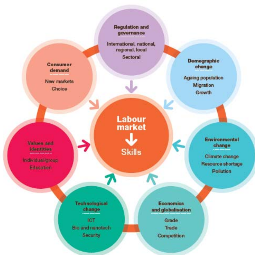
Figure 6.1: The major drivers of change