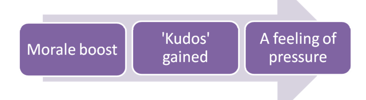
Figure one: Perceived impacts of participating in the pilot

This pressure is around the perceived need to convincingly prove the worth and impacts of community learning, together with the collection of robust and tangible Pound Plus evidence at the same time as delivering within a very tight timescale. The establishment of CLT models, and the involvement of a wider range of different partners, is time consuming and takes work. This was not necessarily something that areas had realised they would be signing up for when they first put their bid together.