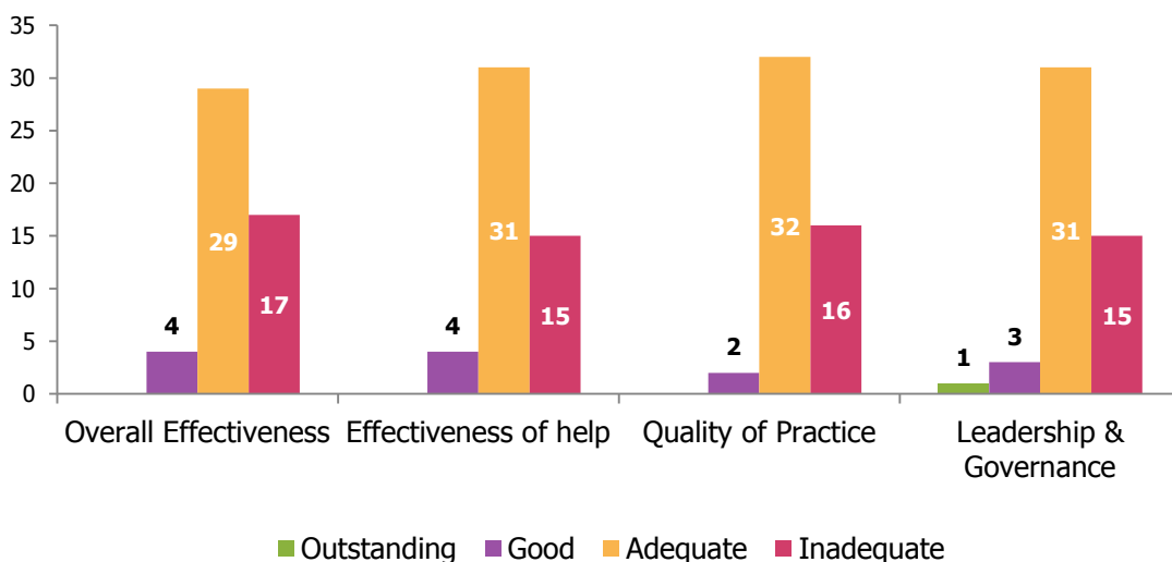
Chart 1: Inspection judgements for arrangements to protect children: local authorities inspected between 1 June 2012 and 31 July 2013

The authorities that were inspected are not a representative sample of local authorities in England. They were those that had been inadequate or adequate with significant weaknesses in their previous safeguarding inspection. Overall, 50 local authorities had inspections under the CPI framework although one local authority was re-inspected, so a total of 51 inspections were conducted. Of the 50 local authorities inspected, 34 per cent (17) were judged inadequate for Overall effectiveness , 58 per cent (29) were adequate and 8 per cent (four) were good.