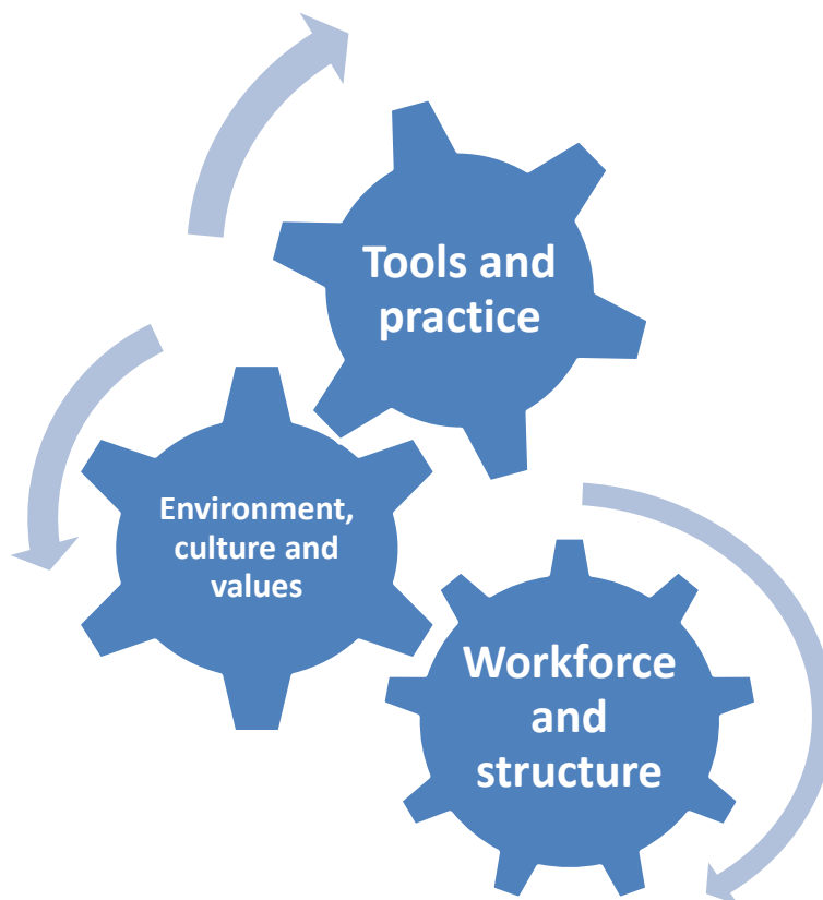
Figure 1 - Common ingredients of successful or promising approaches

Below, we have outlined the full range of factors that came through in our analysis of successful or promising approaches.