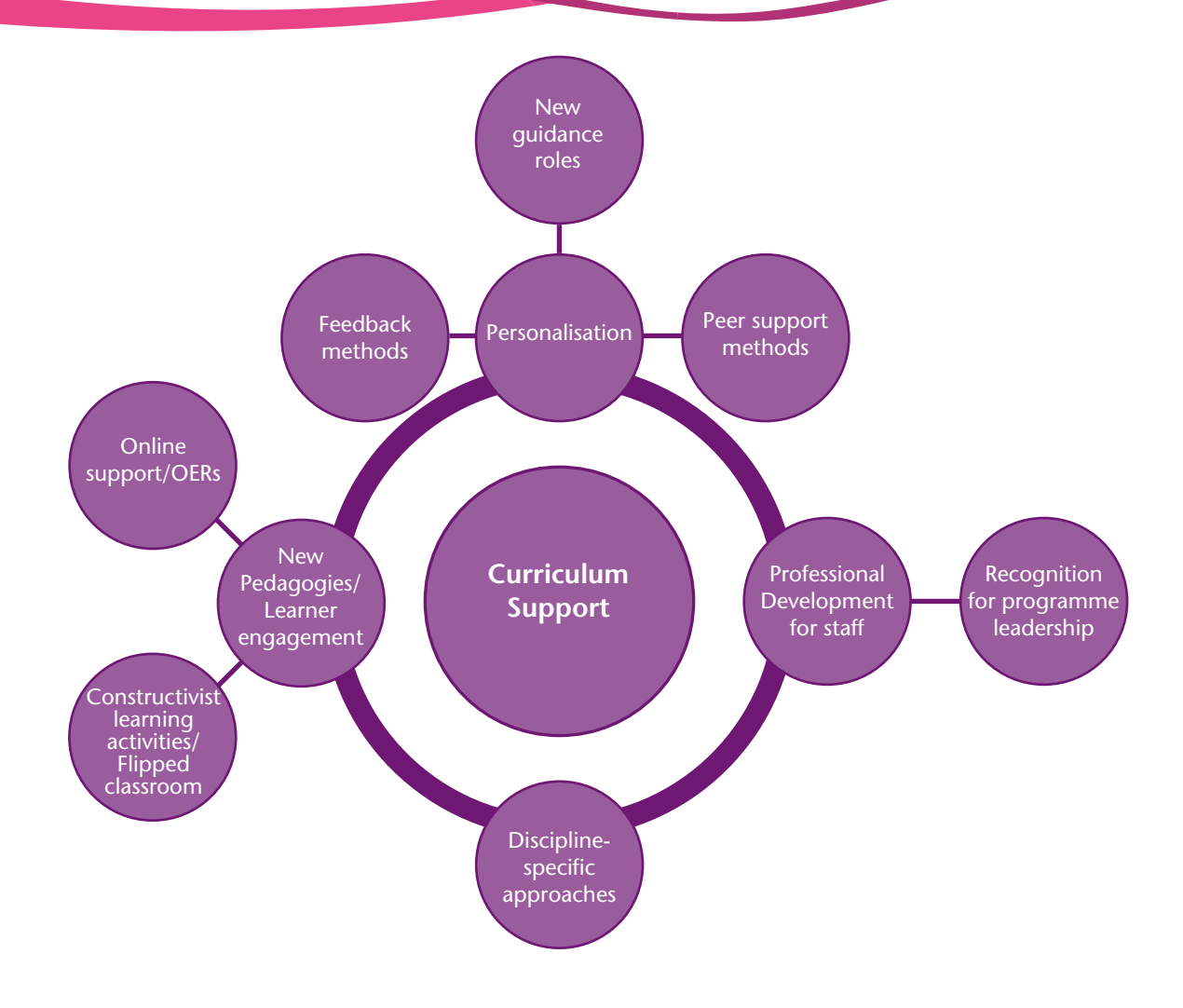
Fig.2: Indicative outcomes for curriculum support