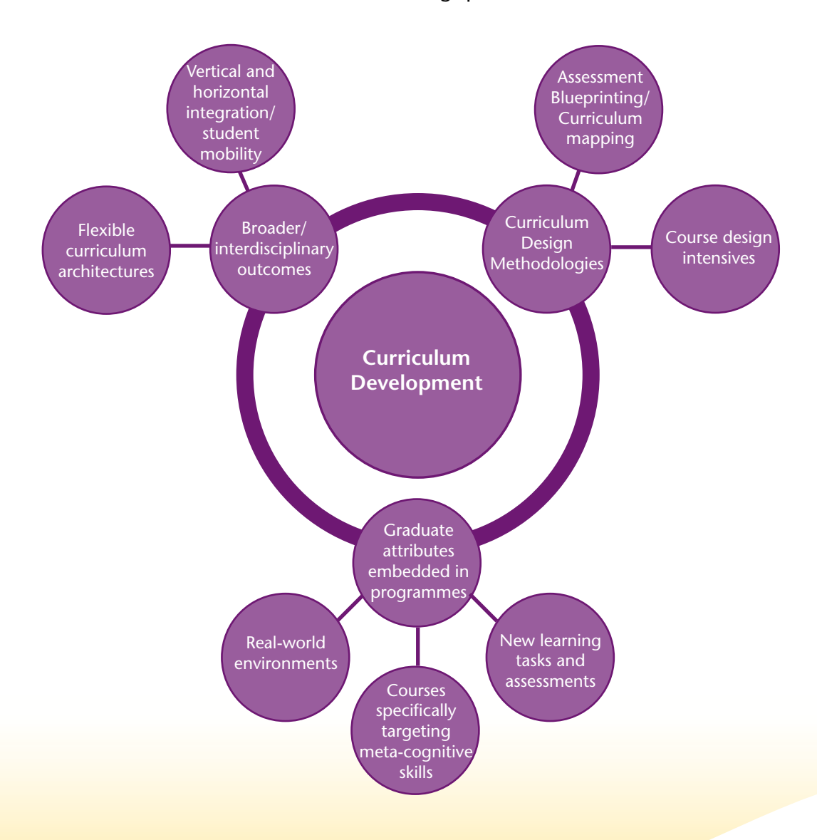
Fig.1: Indicative approaches for curriculum development

Figure 1 summarises approaches to curriculum development while Figure 2 shows the main approaches taken to curriculum support. The various outcomes are discussed in sections 3-5. The discussion is structured around the three framing questions.