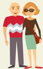
Marriage & Civil Partnership

Tick the areas where you think people in Wales face issues because of each protected characteristic.