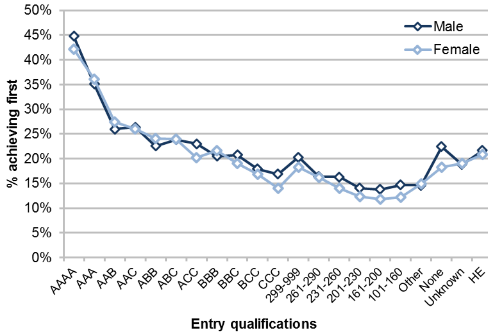
Figure E3: 2013-14 graduates achieving a first class degree by sex, entry qualification and degree classification