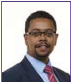
Jeff Cuthbert Minister for Communities & Tackling Poverty

A handwritten signature in black ink, appearing to read 'Vaughan Gething'.