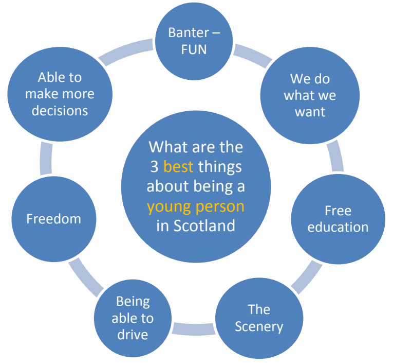
Figure 2: Most frequent answers from the question ' what are the 3 best things about being a young person in Scotland? '

We asked groups to tell us 'what are the 3 best things about being a young person in Scotland?' Many different responses came back, with Figure 2 showing the most frequent.