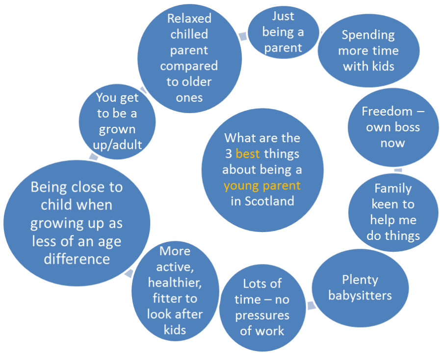
Figure 3: Most frequent answers from the question ' what are the 3 best things about being a young parent in Scotland ?'

We asked young parents ' what are the 3 best things about being a young parent in Scotland? '. There were many different suggestions, with Figure 3 showing the main themes.